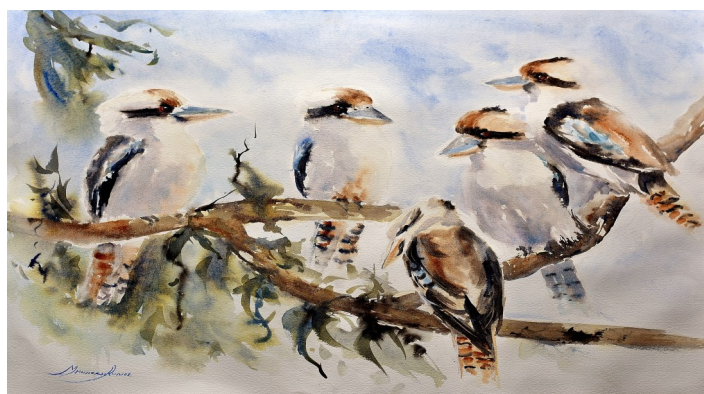
2023 Raffle Prize “Have you heard the latest”